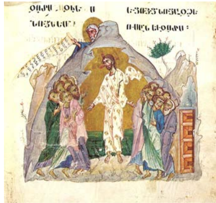
48. Gospel, thirteenth century. Color version in the Armenian Manuscript, Paris Gallery of Art, n° 214, page 118

THE FIFTY DAY FEAST CELEBRATING THE MYSTERY OF THE RESURRECTION OF OUR LORD JESUS CHRIST THE SELECT PASSEOVER LAMB OF GOD