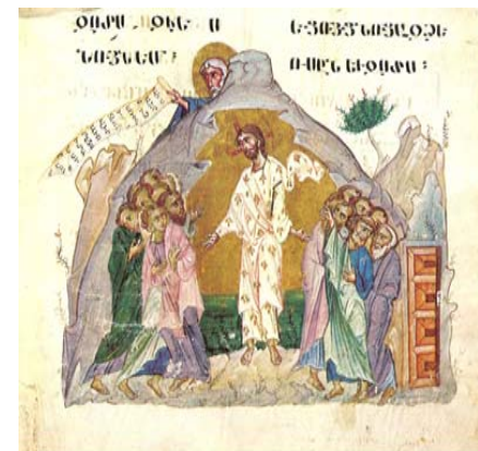
St. Gerasim, manuscript cover. Christ appears to the women. Washington, First Gallery of Art, n° 3148, page 133

THE FIFTY DAY FEAST CELEBRATING THE MYSTERY OF THE RESURRECTION OF OUR LORD JESUS CHRIST THE SELECT PASSEVER LAMB OF GOD